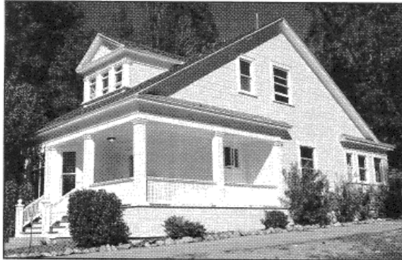
The newly listed Greene and Greene home at 920 Seco St. was built in 1895 is less than a half-mile from the Rose Bowl.